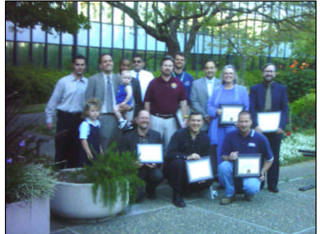
April 23, 2005 Pick Up San Jose!

Members of the Richmond Menker Improvement Team received the District 6 Good Neighbor Award at this year's State of the City Address. They are shown here after receiving plaques at the April 19, 2004 City Council Meeting. Recipients included members of the PRNS, Housing, Planning and RDA staff, Richmond Menker Property Owners, Catalyst, Landgro, MIRA and SONA.